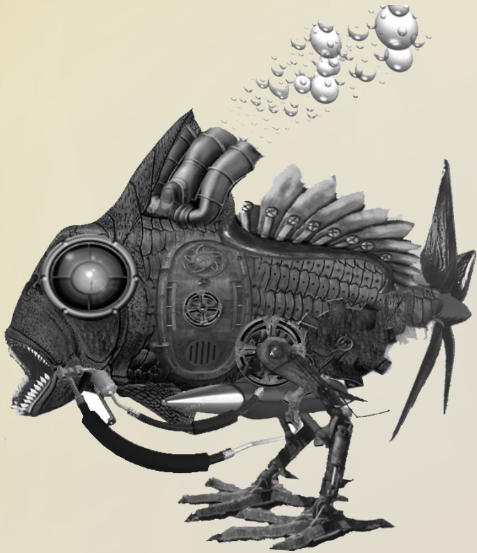
FINNIUS T. ESQUIRE'S UNDER WATER VESSEL, "THE MINNOW".

From Thursday June 26, 2014 to Thursday July 10, 2014