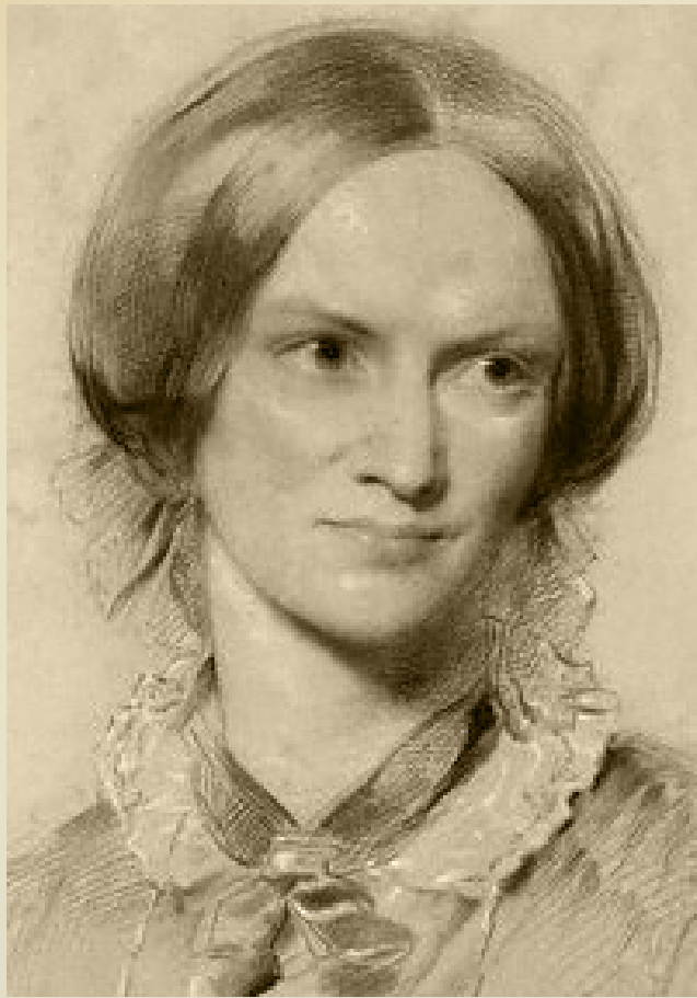
A PORTRAIT OF CHARLOTTE BRONTË, PHOTOGRAPHED BY GEORGE RICHMOND.