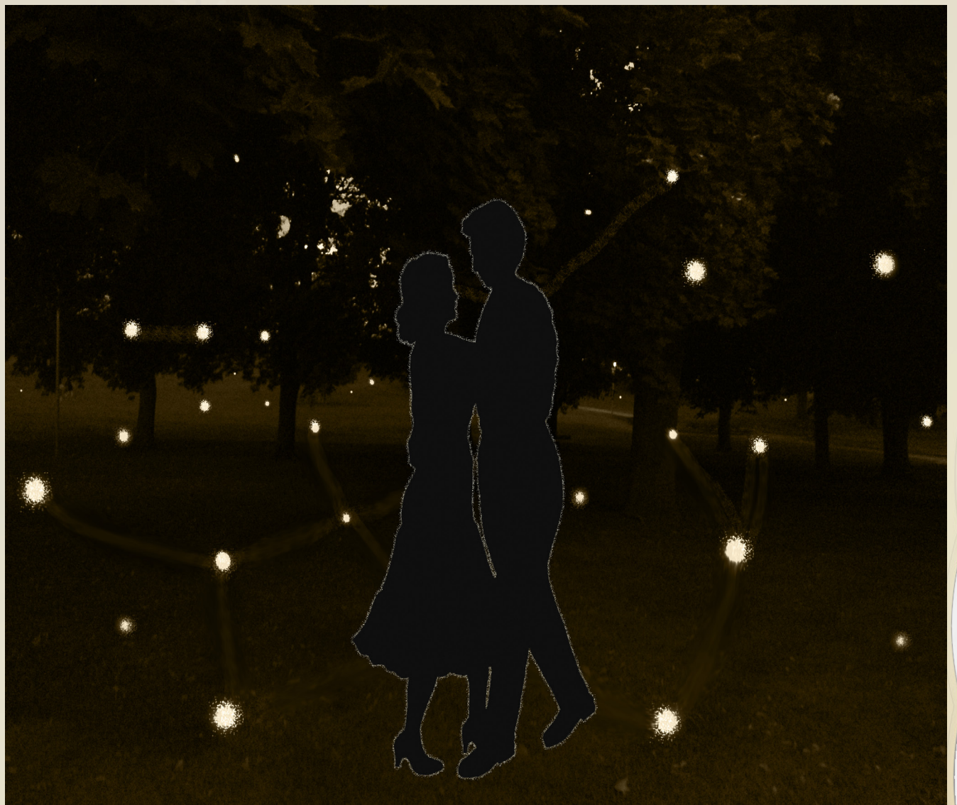
THE FIREFLY GLADE

SHOULD YOU WISH TO SEND A LETTER TO THE EDITOR, SUBMIT YOUR WRITTEN WORK, OR OFFER A TIP REGARDING A POTENTIAL STORY (EG. POLITICAL UPHEAVAL, CRIME, SPECIAL EVENTS, ART AND MUSIC) PLEASE CONTACT LESLIE ORTON AT: ORTONLJ@HOTMAIL.COM .