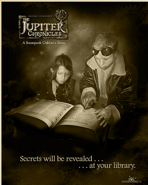
Cover Art for the beloved Children's Book Series THE JUPITER CHRONICLES.