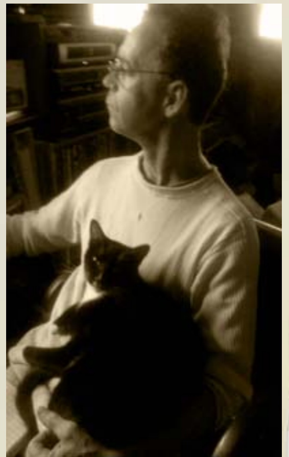
AUTHOR ICHABOD TEMPERANCE

SHOULD YOU WISH TO SEND A LETTER TO THE EDITOR, SUBMIT YOUR WRITTEN WORK, OR OFFER A TIP REGARDING A POTENTIAL STORY (EG. POLITICAL UPHEAVAL, CRIME, SPECIAL EVENTS, ART AND MUSIC) PLEASE CONTACT LESLIE ORTON AT: ORTONLJ@HOTMAIL.COM.