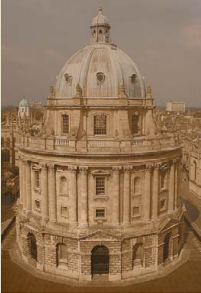
MASTER ARCHITECT SIR REGINALD BEAUCHAMPS CLAIMS THIS OCTAGONAL BUILDING DESIGN WILL BE THE NORM IN 1000 YEARS. 1

From Sunday November 23, 2014 to Sunday December 7, 2014